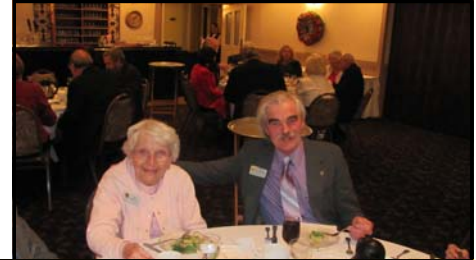
Rochester Lions at the Christmas Party.

On Dec. 8<sup>th</sup> The Rochester Lions Club participated on the 62<sup>nd</sup> Rochester Christmas Parade with a Float, the Theme was "Caribbean Christmas".