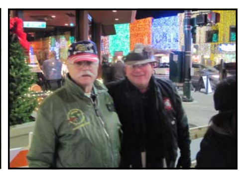
To fill the blanks....

Why are Comet, Cupid, Donner, and Blitzen always wet? Because they are rain deer.