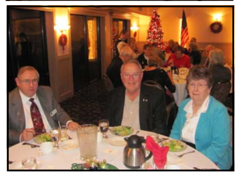
Rochester Lions at Christmas Party December 2<sup>nd</sup> 2013